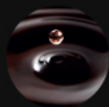
伊賀越天然醬油 Soya Sauce from Igagoe