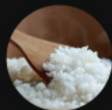
宮城縣環保米 Rice from Miyagi